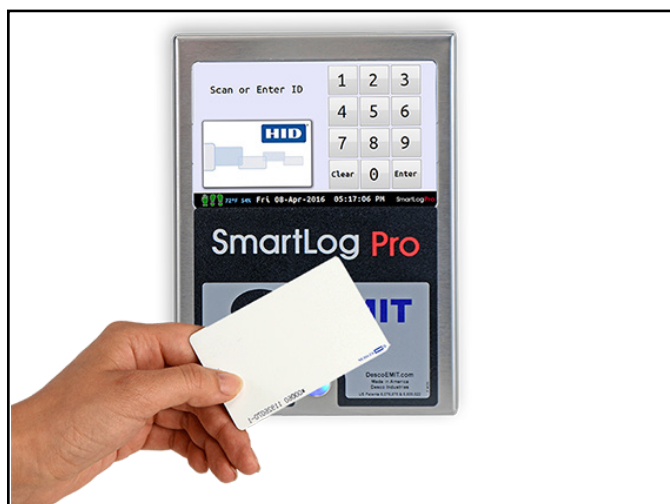
Figure 4. Holding a proximity badge in front of the RFID icon on the SmartLog Pro™

NOTE: Hold the proximity badge in front of the RFID icon for a full second if using proximity badges. See Figure 4.