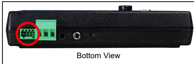
Figure 3. Locating the External Reader port on the Combo Tester X3