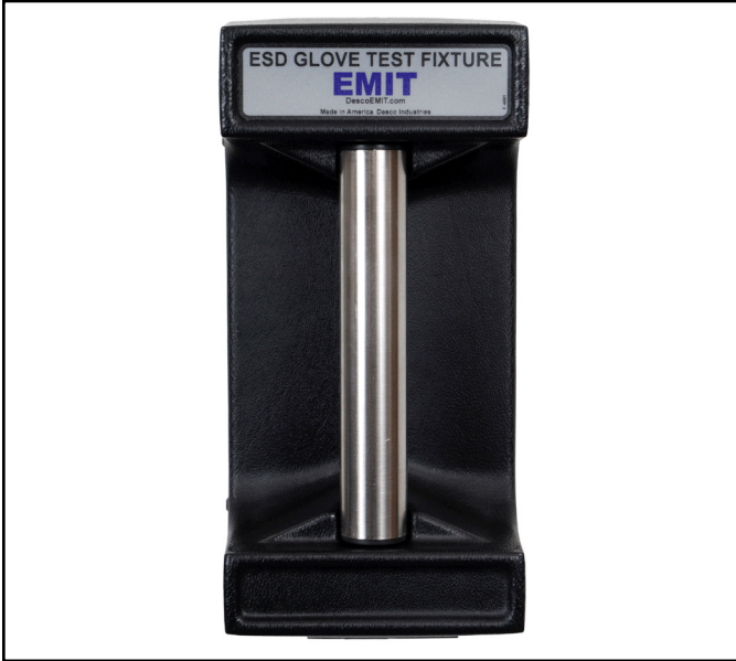
Figure 1. EMIT 50755 ESD Glove Test Fixture