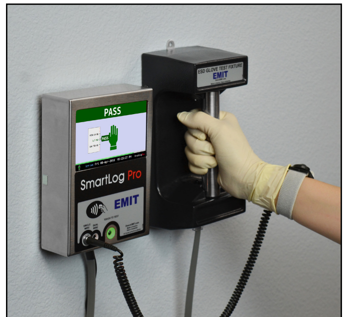
Figure 5. Using the ESD Glove Test Fixture with the SmartLog Pro™

*The SmartLog Pro™ may also be used to test smocks or garments that feature a grounding mechanism for operators using a coiled cord connection.